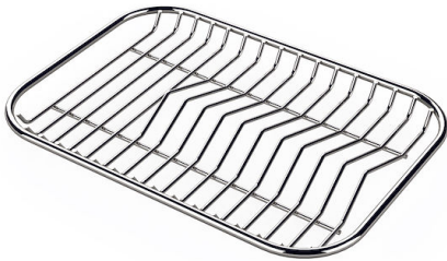
Stainless steel plate rack only usable in combination with the accessories 8644 003 8100 154